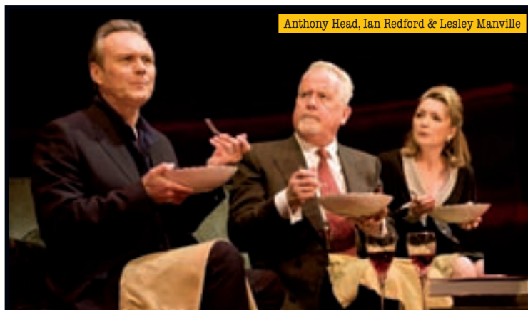
Anthony Head, Ian Redford & Lesley Manville

• Six Degrees of Separation is on at the Old Vic until 3 April. • www.oldvictheatre.com