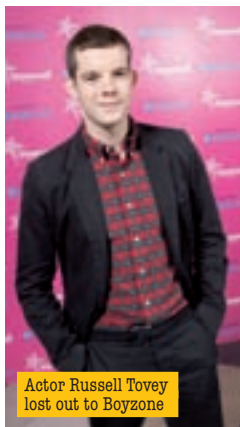
Actor Russell Tovey lost out to Boyzone